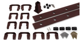
Infill kits: baluster spacers, foot block, mounting hardware