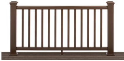
Rail & Square Composite Baluster Kit