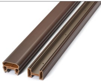
Crown top rail and Universal top/bottom rail