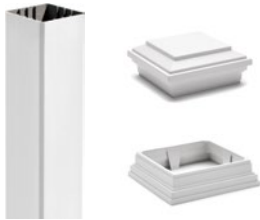
Post components: post sleeve, cap, skirt