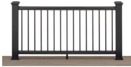
Rail & Round Aluminum Baluster Kit