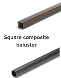
Square composite baluster